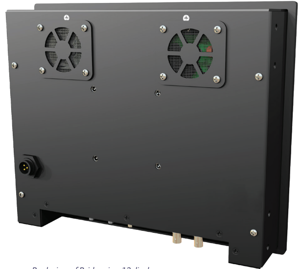
Back view of Bridgeview 12 display