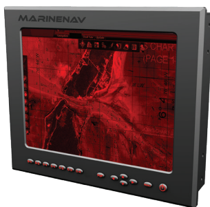
Red Monochrome Night Mode View

While we strive to ensure the accuracy of all items and descriptions in this document, this is not always possible. Specifications, options, and availability subject to change with out notice. Errors and omissions excepted. We reserve the right to limit quantities.